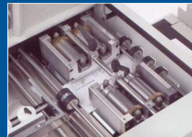
Easy access for setting perimeter seal to the form size.

If the machine stops, the display will show you why - and what to do next.