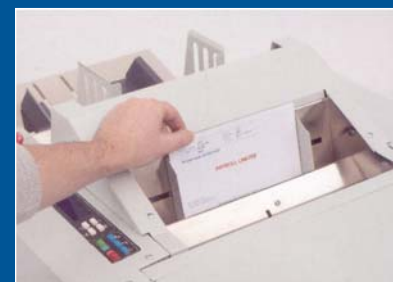
Single form processing to assist the operator and avoid loss of any documents.