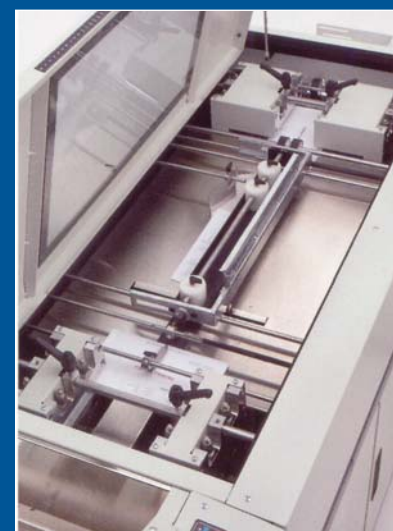
Perimeter sealing which protects the content and the form.

Documents to be inserted are placed in the feed stations and can be continually loaded while processing.